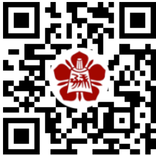
健康照護科學所 官網 Institute Website