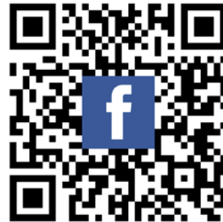
健康照護科學所 臉書專頁 Facebook Page